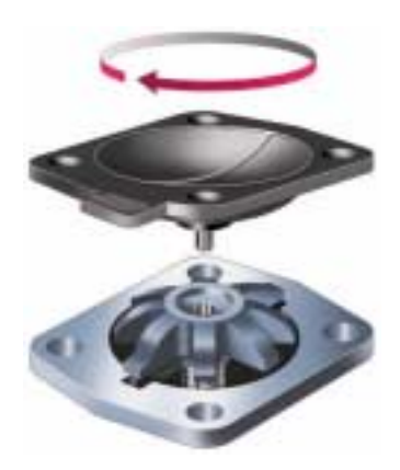
Rubber diaphragm screw fixing