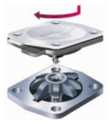
PTFE diaphragm bayonet fixing